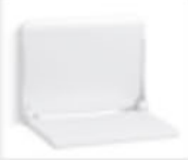
First Bathroom KOHLER® Fold Down Shower Seat, White

Each accessory is customized to your exact preferences and installed with meticulous attention to detail. Our experts ensure secure attachment and precise placement, creating a seamless and personalized look.