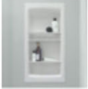
First Bathroom KOHLER® Shower Niche, White